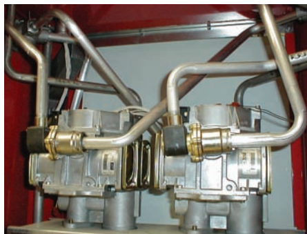
Select SHC Series utilizes two Wayne electronic iMeters manifolded to each hose for superior flow performance