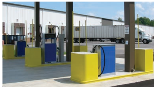
Master and satellite models allow for the convenient and quick fueling of trucks with saddle tanks