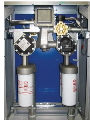
Select UHC Series features high flow Liquid Controls meters, dual internal 40 GPM filters per meter, and a streamlined flow path to provide maximum flow performance and clean fuel